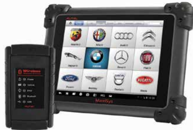
MaxiSYS Diagnostic System Generously Donated by AESwave MSRP: $3,295.00

MaxiSYS® has the industry's first multitasking Android Operating System and the comprehensive OE-level vehicle coverage that Autel has become known for.